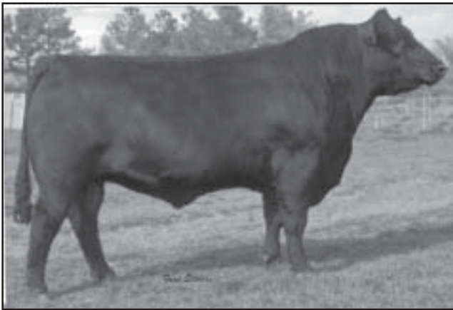
KCF BENNETT PERFORMER