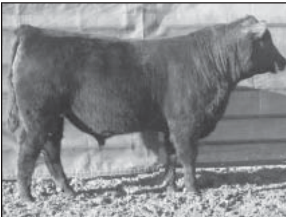
LOT 45 ~20~