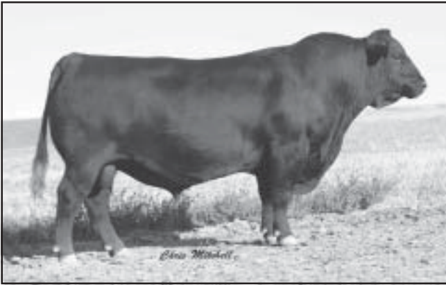
BOYD ON TARGET 1083