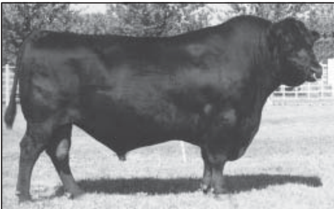
BASIN Max 602C