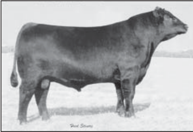
B/R New Frontier 095