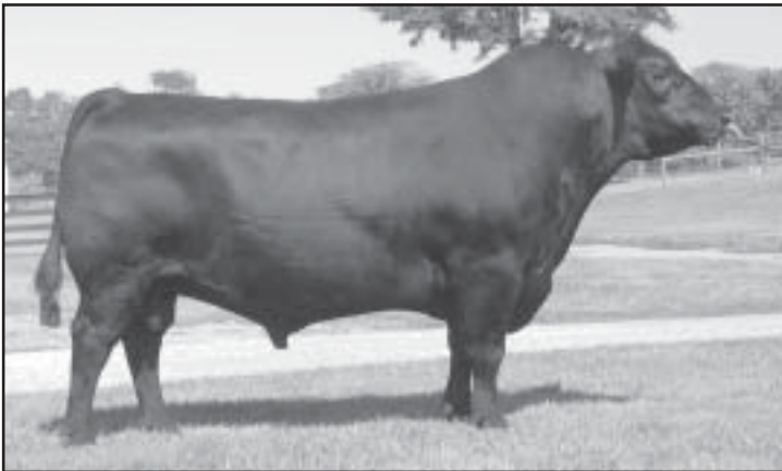
BT Right Time 24J