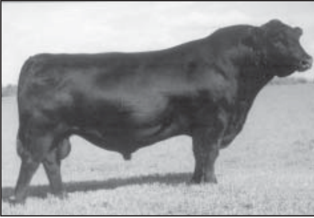
BOYD NEW DAY 8005